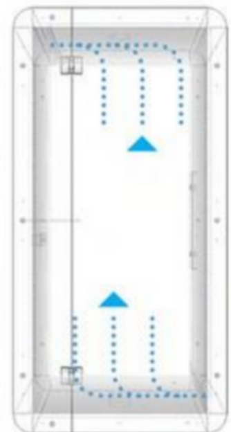
*Air Flow Diagram

Seismic bracing LCD TV mount bracing White glass board - W: 34" x L: 30" Personalized company branding Ethernet ports Bluetooth speaker