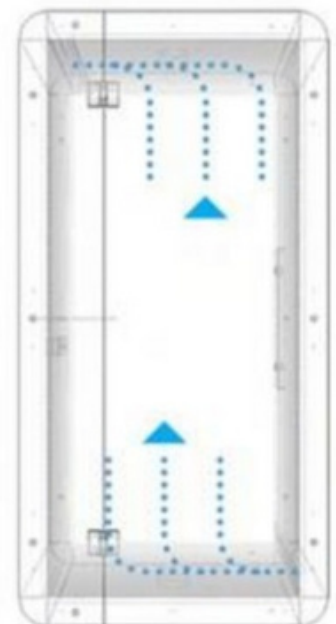
*Air Flow Diagram

Seismic bracing LCD TV mount bracing White glass board - W: 34" x L: 30" Personalized company branding Ethernet ports Bluetooth speaker Frosted film glass Sprinklers Smart lock